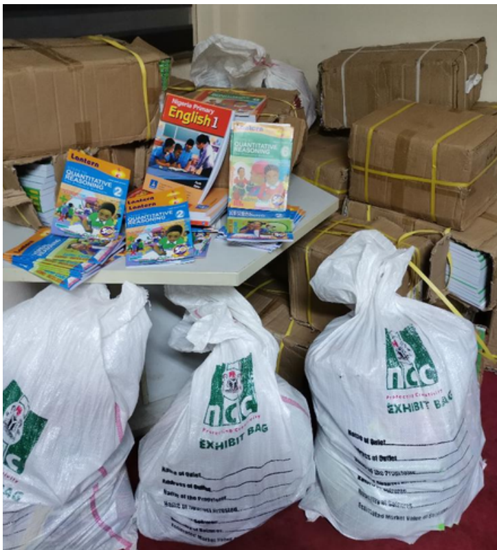
Some exhibits of text books apprehended during an NCC antipiracy operation in Mararaba, Nasarawa State.