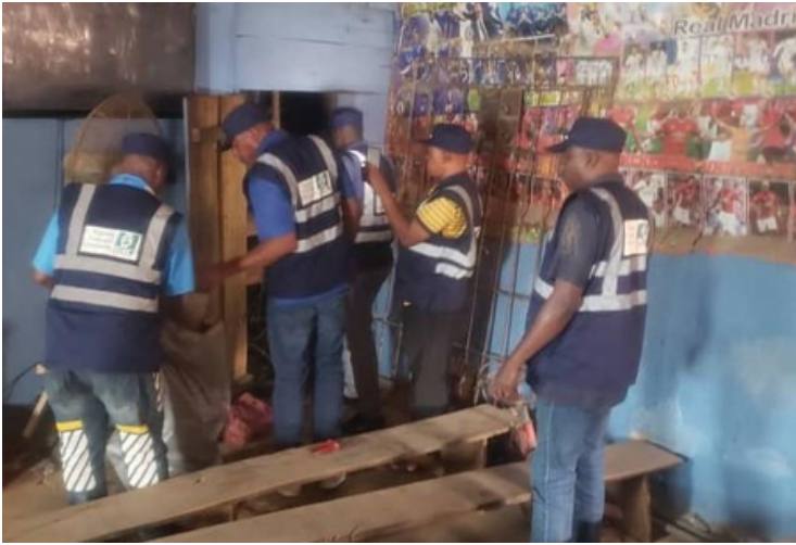
Copyright Inspectors confiscating contrivances from the suspect's engine room during an anti-piracy operation in Onitsha, 22nd December 2022.