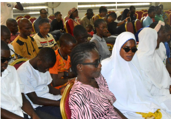
A cross section of some participants at the celebration of 2022 International White Cane Day organised by the Nigeria Association of the Blind (NAB), FCT Chapter at the National Human Rights Commission, Abuja 15th October 2022.