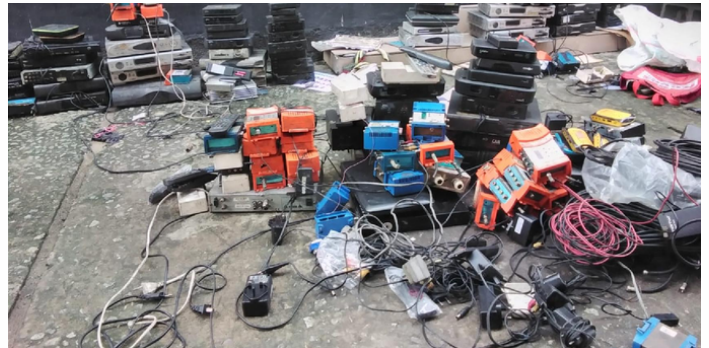
Some contrivances seized during the broadcast anti-piracy raid in Port Harcourt on 11th November 2022.