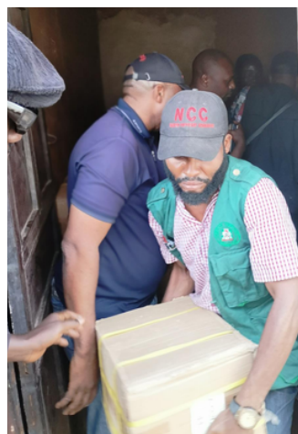
Copyright Inspectors impounding loads of suspected pirated text books during an NCC enforcement operation in a warehouse in Mararaba, Nasarawa State on 13th October 2022