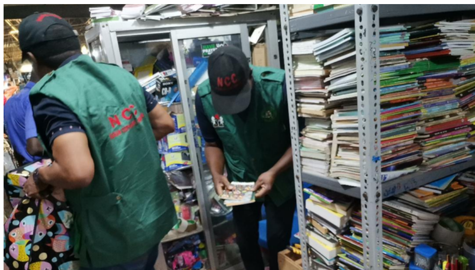
NCC Copyright Inspectors confiscating some suspected pirated books at one of the prime bookshops during an anti-piracy operation at Area 1 Shopping Complex, F.C.T Abuja, 5th October 2022.