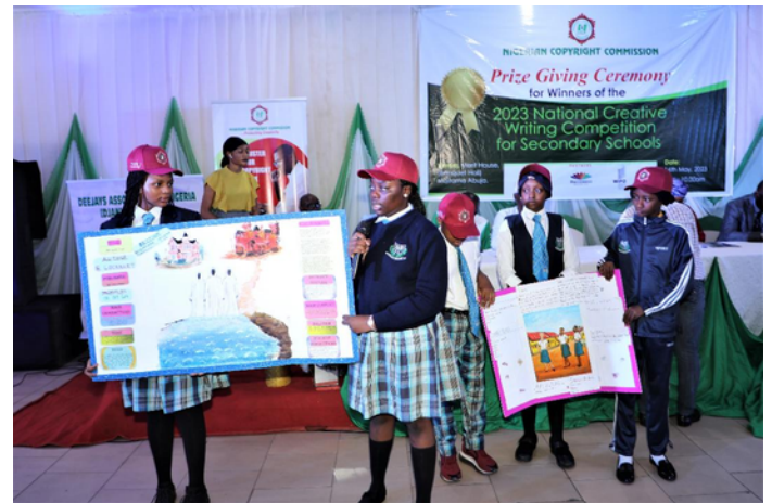
Students of Dambo International School, Abuja, making a presentation during the Prize Giving Ceremony of the 2023 National Creative Writing Competition for Secondary schools in Abuja.