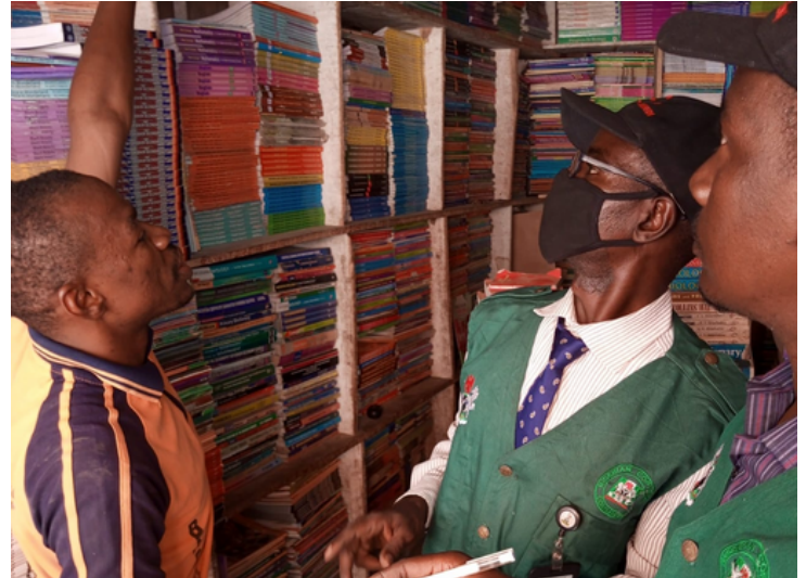
Copyright Officers of NCC Kano Office, inspecting a bookshop in Kano market, 15th June, 2023.