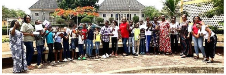
Staff of NCC Enugu Office joined by staff of the National Library and kids from Reading Club of National Library, Enugu during a Copyright enlightenment exercise on 16th April, 2023 in commemoration of the 2023 World Book and Copyright Day.