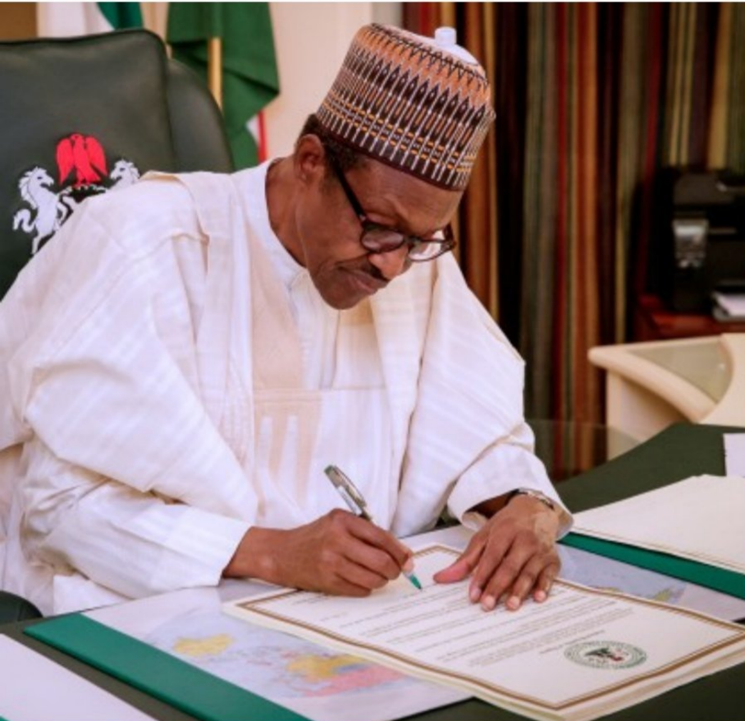
His Excellency, President Muhammadu Buhari, GCFR

A NEWSLETTER OF THE NIGERIAN COPYRIGHT COMMISSION