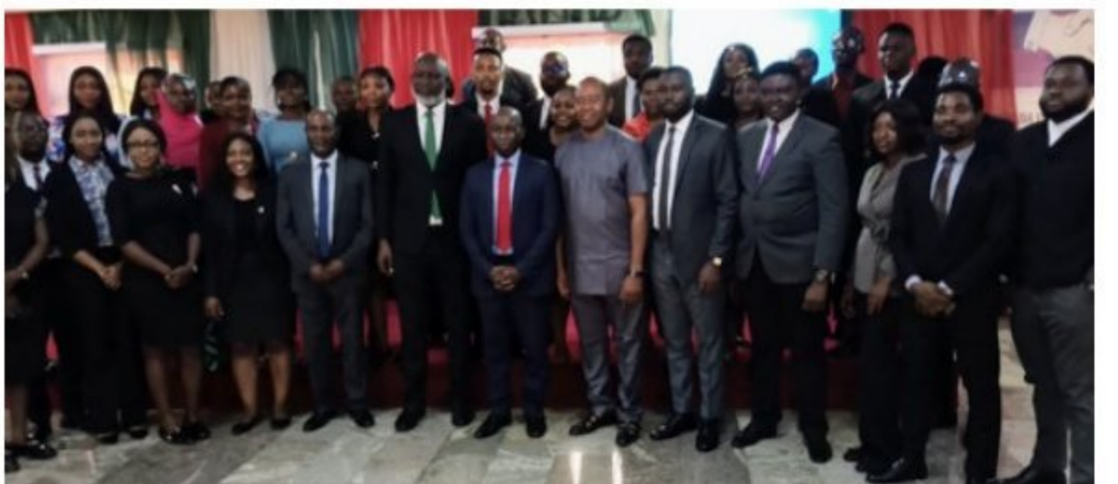
Chairman NBA, Abuja Branch (6th L), DG NCC (7th L) with resource persons and participants at the capacity building workshop organised by the NCC for young lawyers of the Branch in Abuja on 28th March 2023.