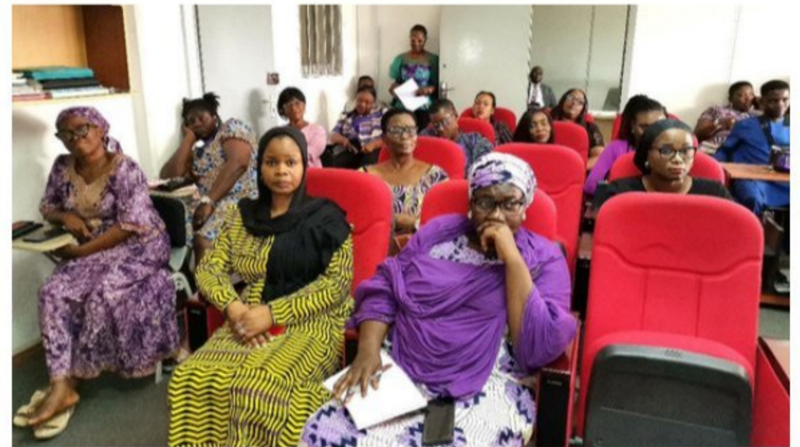
A cross section of participants at the hybrid interactive session in commemoration of International Women's Day (IWD) held at the Commission's headquarters, March 8, 2023.